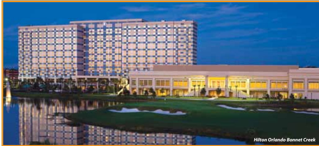
Hilton Orlando Bonnet Creek

Nestled within 482 acres, the Hilton Orlando Bonnet Creek is a full-service Orlando resort that is just minutes away from the Disney Theme Parks, Water Parks and Downtown Disney®. The hotel has over 1,000 guest rooms, including 36 premier suites and features a world-class convention center with outstanding meeting space and conference facilities.