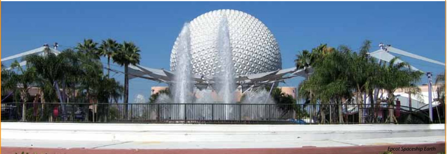
Epcot Spaceship Earth

Held in conjunction with the NISH National Training and Achievement Conference